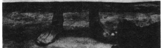
The Emperor hath clothes?